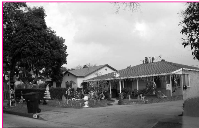
530 Ramona Street – Southwest Winner