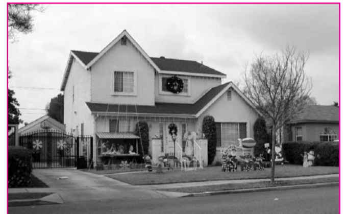
1223 Euclid – Southeast Winner