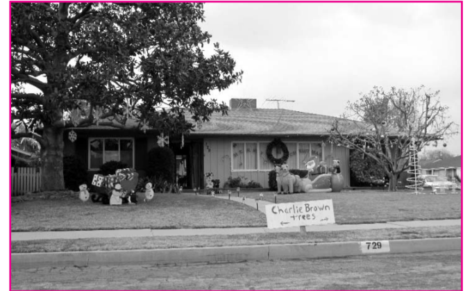
729 N. California – Northeast Winner