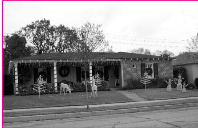
420 Segovia – Northwest Winner

The Residential winners of the 2011 Holiday Decorations Awards Program are: