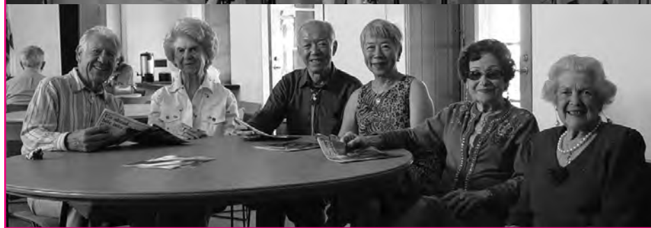
Friends lunching at the San Gabriel Senior Center. Bring a friend for lunch and dance!