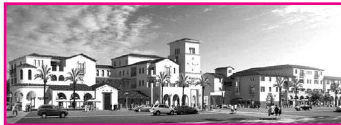
261 S. Mission Drive

Leading the way is the Mission Gardens project at 400-412 W. Mission Road. The first new project approved under the Mission District Specific Plan, completion is expected at the end of this year. Elegantly designed in the traditional Spanish Colonial Revival architectural style, 22 courtyard residential town home style units surround gracious courtyards on a 1.37-acre site located at the southeastern gateway to the Mission District. Nearby Mission Road, Anderson Way, and Main Street will all benefit from streetscape improvements.