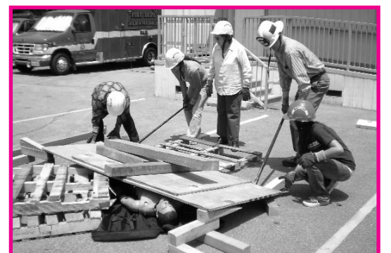
CERT members receive extensive training to prepare for disasters in their neighborhood