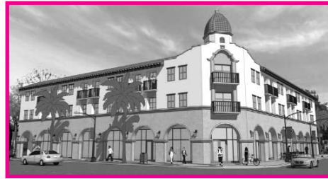
130 S. Mission Drive