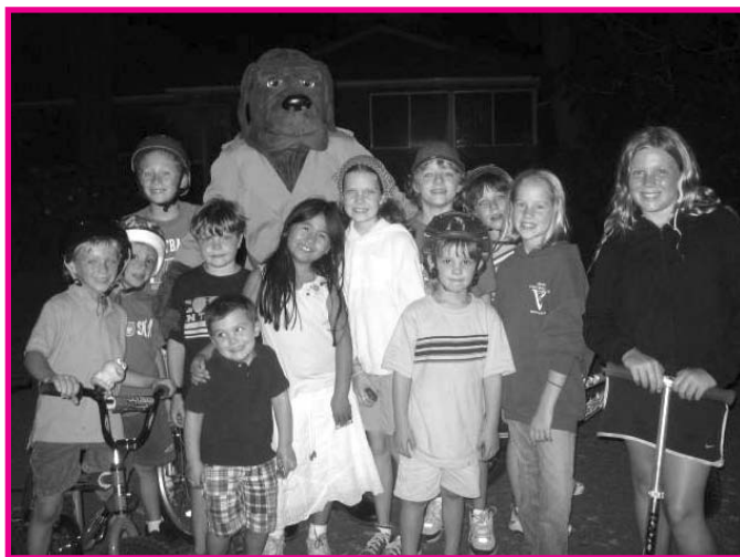
Neighbors will gather together on August 5 with McGruff to take a bite out of crime

Grilling and eating hot dogs and burgers, exchanging desserts, painting kids' faces, and meeting with City officials, police, fire and military personnel — the community is getting ready for a fun and rewarding evening on Tuesday, August 5. That's when neighborhoods throughout San Gabriel will again join forces with thousands of communities nationwide for the 25th anniversary of National Night Out (NNO) crime/drug prevention event. This marks the 14th year that San Gabriel will participate.