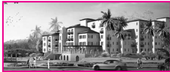
235 S. Arroyo Drive and 35 Hampton Court