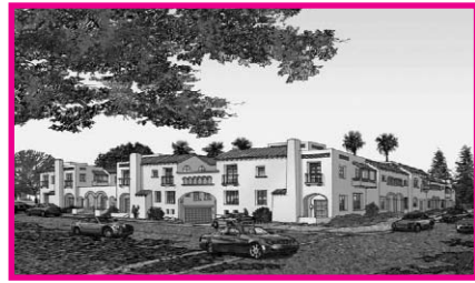
400-412 W. Mission Road

Four large development projects are now underway in San Gabriel's historic Mission District along with improvements to the Alameda Corridor East.