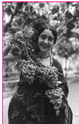
Celebrating "National Grape Week" in San Gabriel, 1928

中文 | español www.sangabrielcity.com | www.sangabrielcity.com