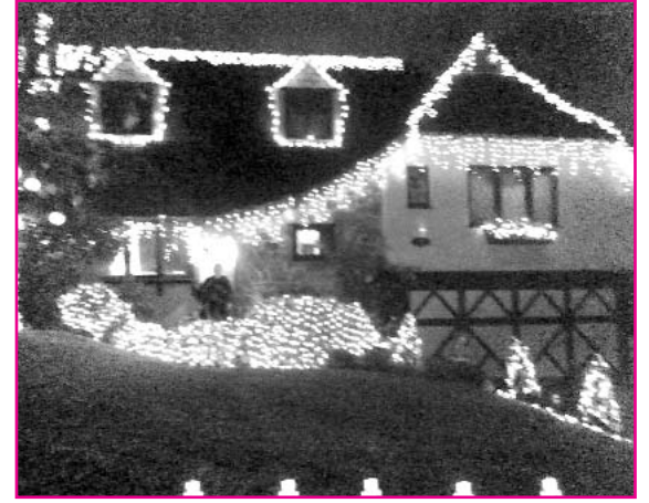
1021 Roses Rd.