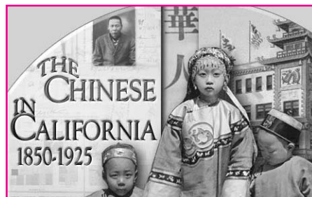
Chinese in California "Collage"