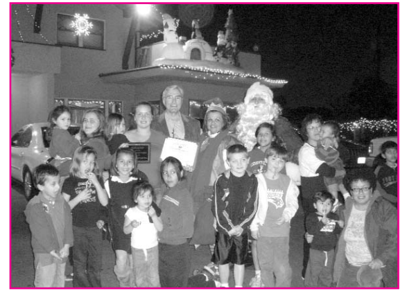
330 E. Las Tunas Dr. - Executive Associates, Inc.