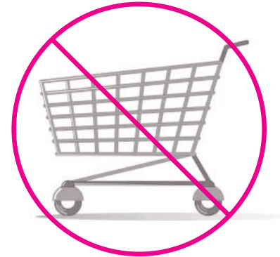
Keep San Gabriel beautiful - report stray shopping carts

San Gabriel needs your help! Make a difference in the look of our neighborhoods and help keep San Gabriel beautiful by reporting shopping carts that are being taken from shopping centers and left on nearby streets and sidewalks; following the guidelines for disposing of trash and debris, and by reporting graffiti.