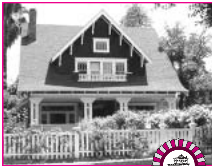
1719 Monterey Road South Pasadena